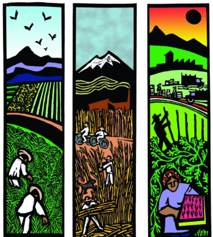
Artwork by Rini Templeton. From Agriculture Workers' Alliance website: http://awa-ata.ca/en/

Over 100 migrant worker appeals are argued in November before the Office of the Umpire.